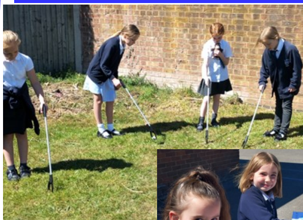
Earth Day activities.

Year 5 have been getting to grips with their new 'Space and Earth' science topic. Not only did the children become the solar system using various sized fruits and PE equipment, they also came up with brilliant questions that they then researched and found out the answers to. Everyone thoroughly enjoyed the lesson and are looking forward to learning more! Can your child remember what they asked? (Miss Blackman)