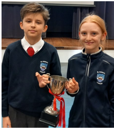
Our wining House Captains

The winning House last term was Wisley with 954 points followed by Brooklands , Boxhill , Painshill and Polesden Lacey . Wisley pupils have a mufti day on Friday 17 January to celebrate their success.